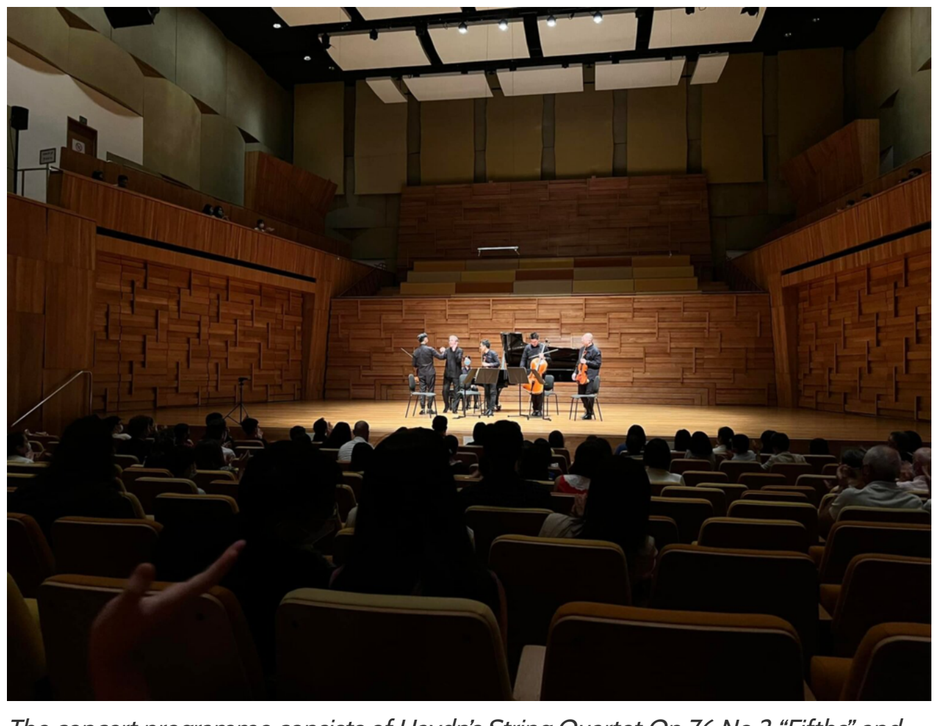
The concert programme consists of Haydn's String Quartet Op.76 No.2 "Fifths" and Borodin's String Quartet No.2 in D Major.